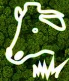
Cattle & beef