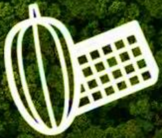
Cocoa & Chocolate

If you export any of these products to the EU, EUDR applies to you: