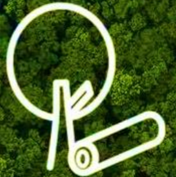
Wood & rubber